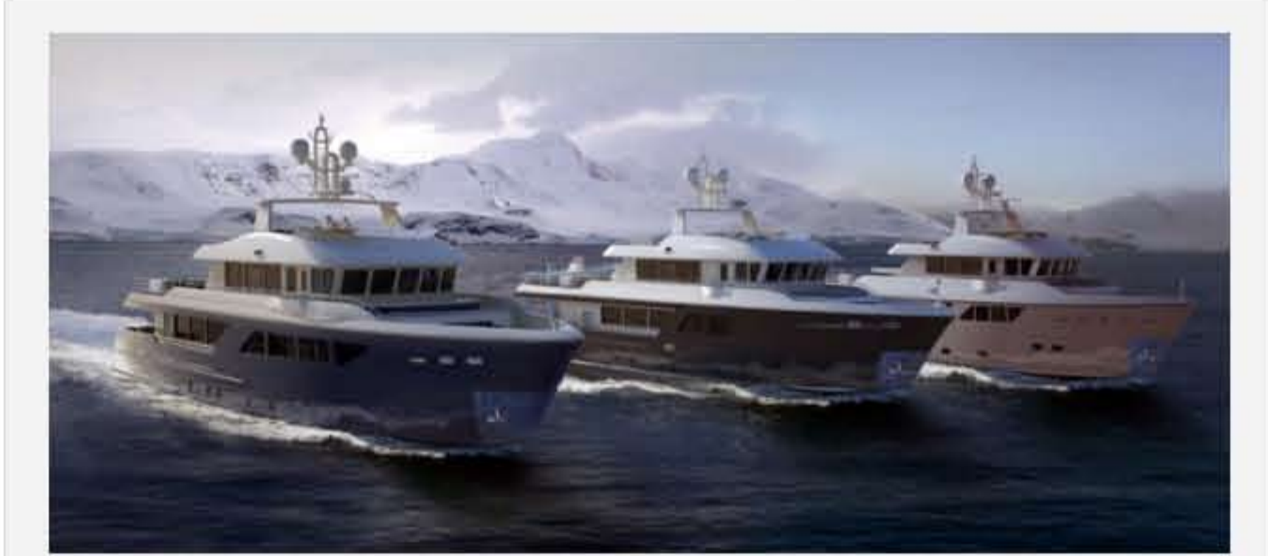
Superyacht Darwin 107', luxury yacht Darwin 102' and Darwin 86' yacht by CdM and Hydro Tec-Sergio Cutolo

New Columbus 57m Classic superyacht is a beautiful displacement vessel, representing a real challenge for the design and engineering studio lead by Sergio Cutolo. The owner requested many solutions not easily integrated on a vessel measuring 57 meters in length, such as five enclosed decks plus a huge sundeck. The studio has developed solutions where the design and technical aspects could work hand in hand.